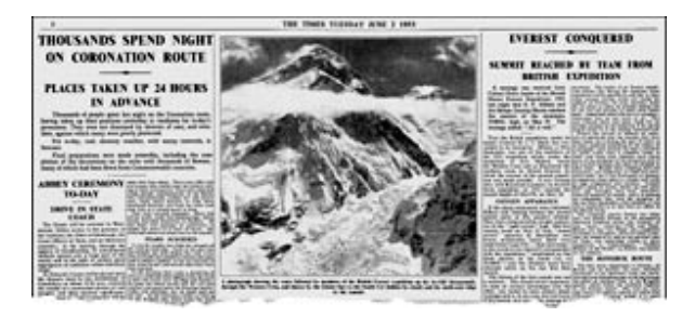
I slept fitfully. It was my last night under the

It was long after dark when we reached Base Camp, to be greeted by my loyal Sherpas. I rumbled into my sleeping-bag and typed out a code message to tell the world that the mountain had been climbed by Hillary and Tenzing. It ran: "Snow conditions bad stop advanced base abandoned may twentynine stop awaiting improvement." This little dispatch I checked and rechecked before sealing it and handing it to a runner; his instructions were to leave at first light the following morning and deliver it to the radio station at Namche for transmission (with luck) to Kathmandu. Another runner was to leave for Kathmandu direct carrying a duplicate message and a longer account of the victory.