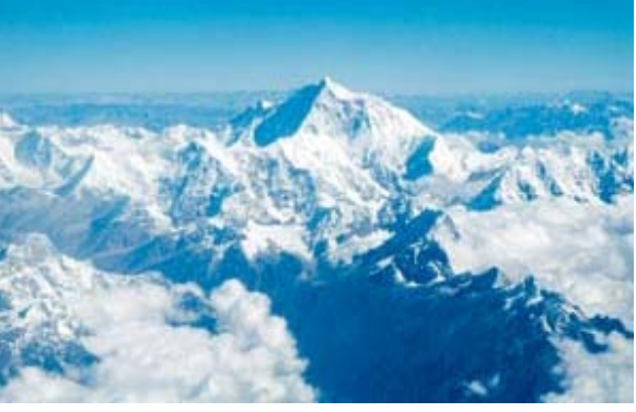
Rising majestically above the clouds is Mount Everest. Awestruck climbers say the vista underlines for them the vastness of the Earth and the insignificance of people

For many climbers there is no great revelation but for others the emotion is overwhelming, says Nicholas Roe