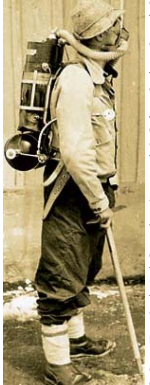
An early version of the oxygen cylinder, some of which weighed 47lb

Of all the key advances that made the ascent of Everest possible none was more important and more vital to success than the use of bottled oxygen.